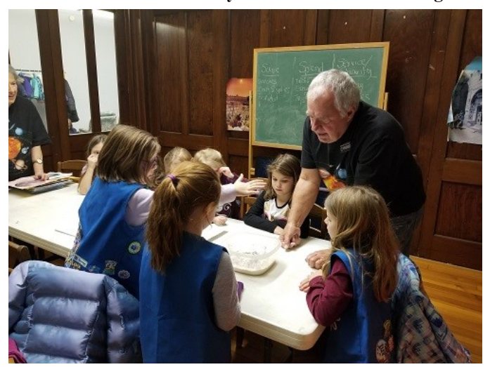
Moon craters: We tossed rocks into a bed of flour with a bit of coco on the top to illustrate a strike effect!! Big hit!!!!