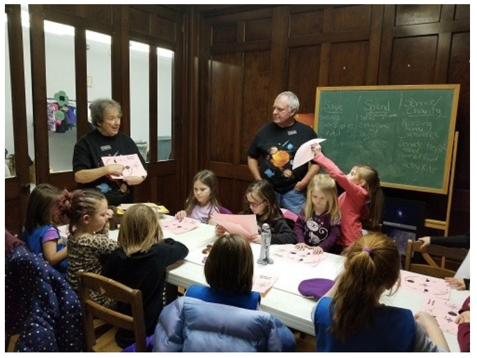
Moon Phases: We used oreo cookies (with permission of the leader) to illustrate (and then eat) the major moon phases.....delicious!