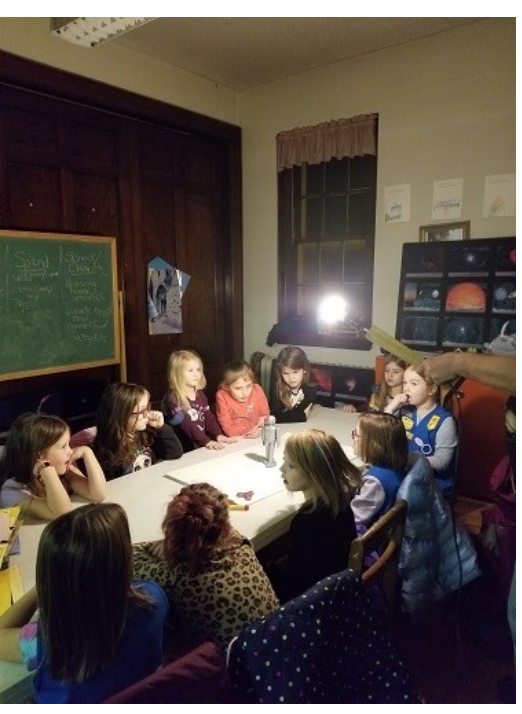
Shadow effect of Earth rotation: They enjoyed "Gort" our space robot, and they knew am/noon/pm, but Sun "not" really rising is a tougher concept.