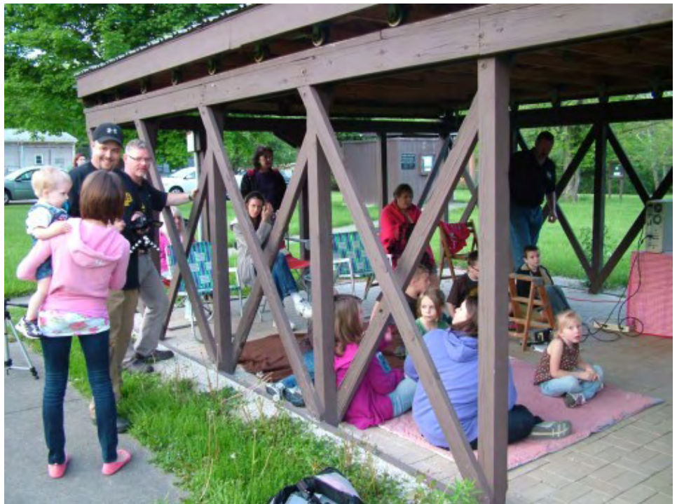
Members of Cub Scout Pack 3339 of Clinton, OH get ready for a star party presentation.