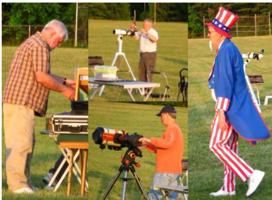
Members of the ACA set up their gear for Camp CHOPS 2011 (Children's Hospital Oncology Patients and Staff) at Camp Carl.