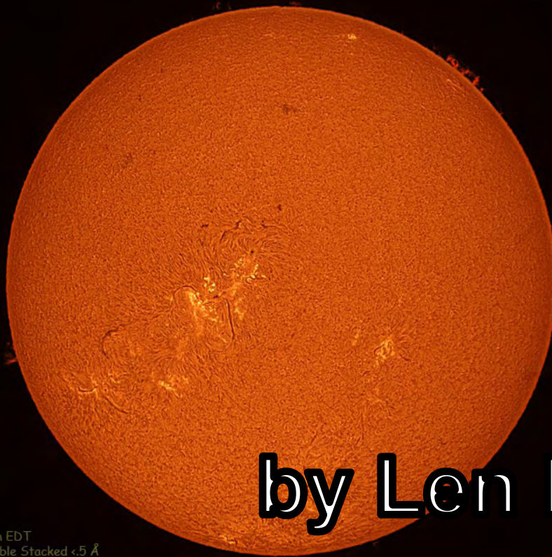
Sun - 03/27/2011 03:30 pm EDT Coronado Maxscope 90 Double Stacked \lt 5 \text{ \AA} SBIG ST2000XM By: Len Marek