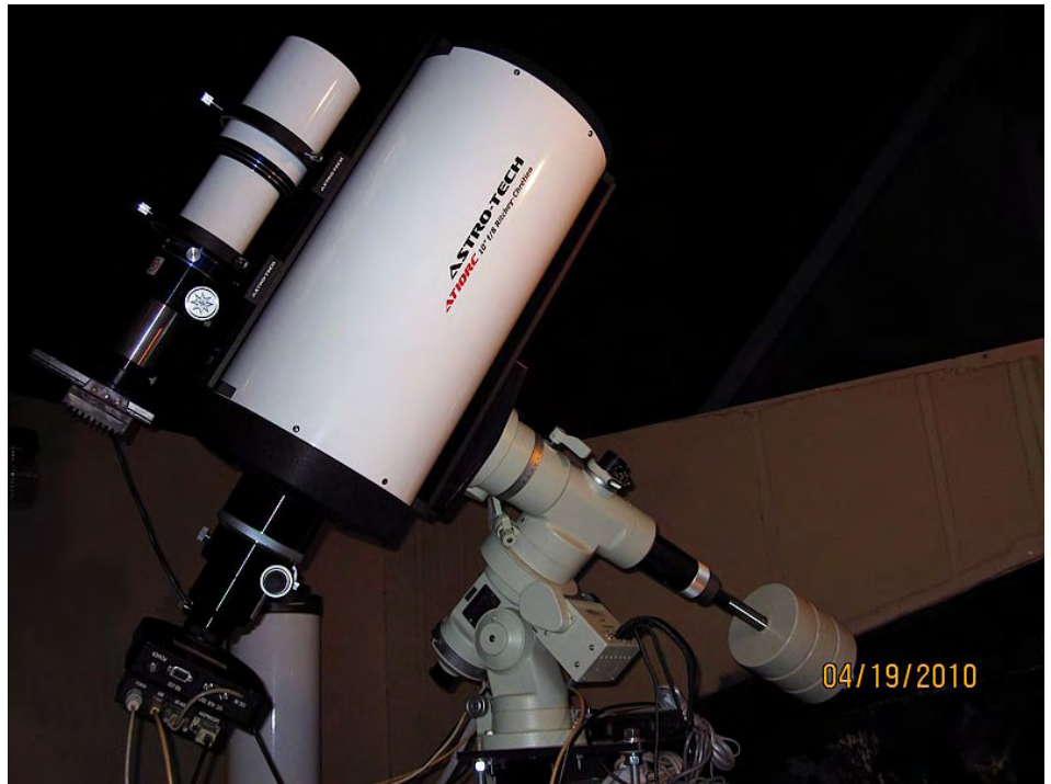
Illustration 1: AT10RC on Takahashi NJP at Urban Observatory April, 2010

One thing that's very different about selecting an imaging telescope is that the first thing one considers is focal length. Unlike a visual setup, where one will select an eyepiece to give the desired magnification and field of view, an imaging setup is