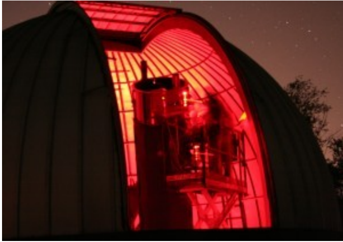
The Warren Rupp Observatory