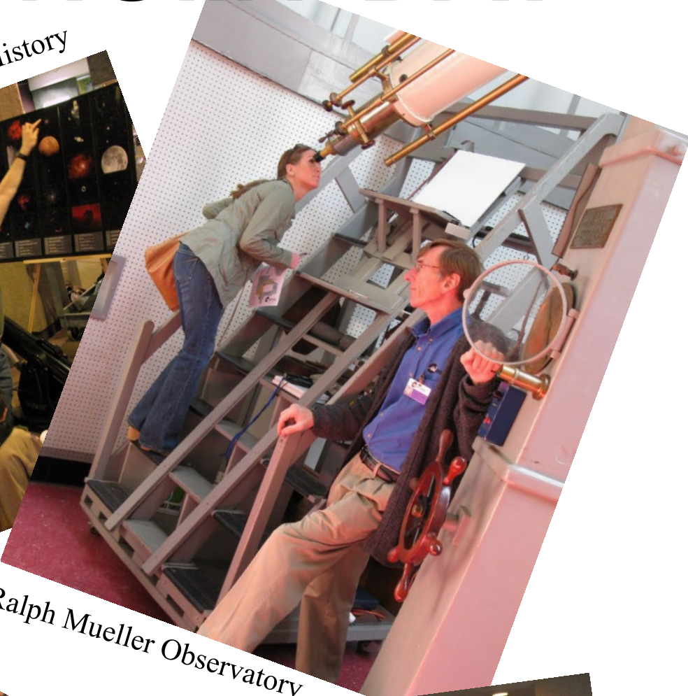
Ralph Mueller Observatory