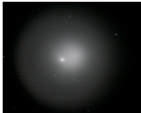
Comet 17p Holmes imaged through the Astronomy Club of Akron's Meade LX200 14" Schmitt-Cass.