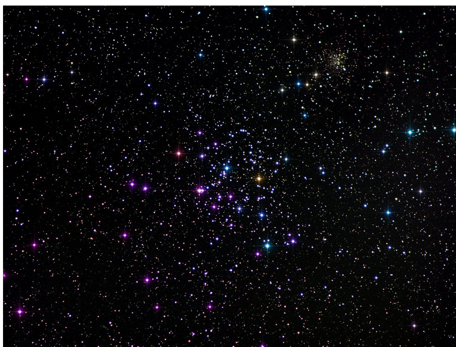
Open star cluster M35 with NGC 2158 (small cluster) By ACA Member Len Marek. I used the Tele Vue Genesis SDF with the same camera equipment used for M42, the Veil nebula published in February's newsletter. With it being only 17 degrees outside I was able to cool the camera's CCD chip down to -30 deg C. This resulted in very little image noise. I also applied flats in the processing steps using CCDSoft. The image consist of 5 frames, 3 minute exposures each in Red, Green, and Blue.