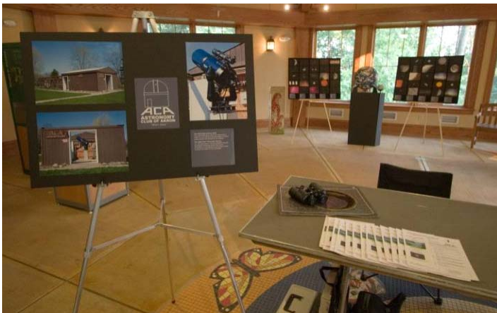
ACA Display at the Akron Zoo event