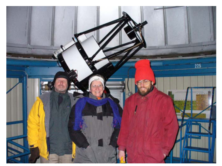
All considered, it is the experience of a lifetime for an amateur astronomer and we plan to return.

I only have two pieces of advice. First, prioritize your viewing. We all know that there is so much to see and second, most importantly, DRESS WARMLY. At the nearly 7000 foot altitude, nighttime temperatures, even inside the dome, were in the mid 20's.