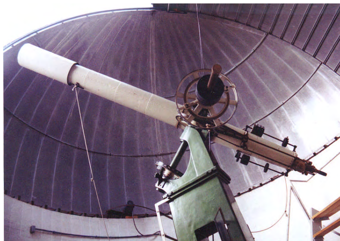
12.5" McMillin refractor at the Ballreich Observatory of the Sandusky Valley Amateur Astronomy Club

Friday night the skies were excellent. I spent a lot of time at the eyepiece of my 8". The night was cold with a light breeze, so every so often