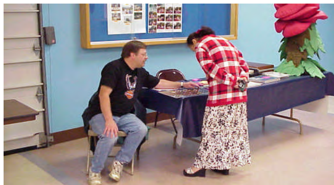
Rich promotes sales at a monthly meeting.

That's how it was in 2000, not bad three out of five with excellent viewing and to get three in a row is almost unheard of for Ohio. I hope you all plan to attend at least one of the many OTAA & other star parties in 2001. If so, I'll see you there. Keep looking up.