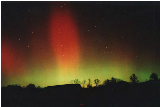
Aurora display at the Fall 2000 ACA Dark Sky Star Party.

web site and look at the pictures of this experience. It was the perfect night. A perfect location at 1200 feet atop a hill, perfect viewing conditions of the sky, a dozen or so satellites, over 50 meteors, and the most incredible display of aurora I have ever seen, one for the record books.