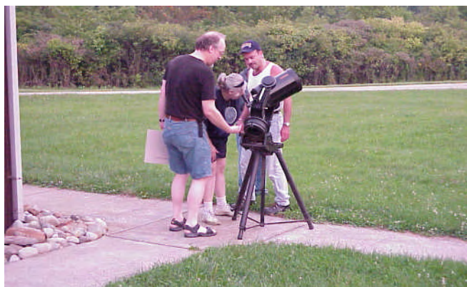
More activity at the ACA Observatory during the past summer.

That's how it was in 2000, not bad three out of five with excellent viewing and to get three in a row is almost unheard of for Ohio. I hope you all plan to attend at least one of the many OTAA & other star parties in 2001. If so, I'll see you there. Keep looking up.