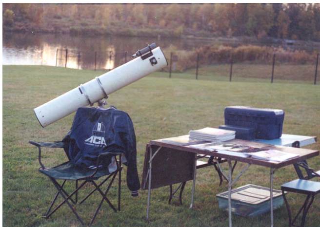
ACA set up at Silver Creek