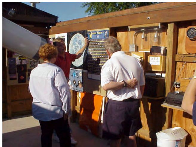
Visitors to the ACA observatory at the July 22 public program.