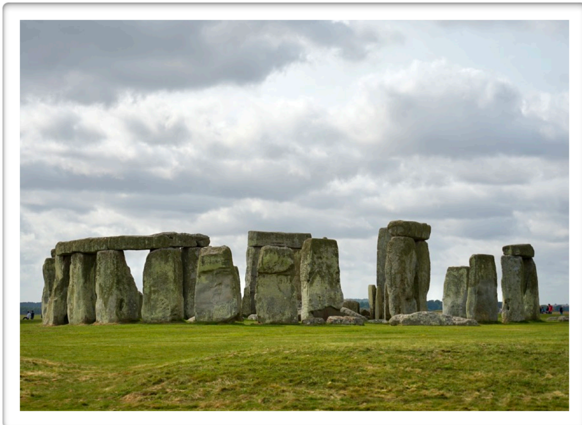
Stonehenge, UK 8/18/2024