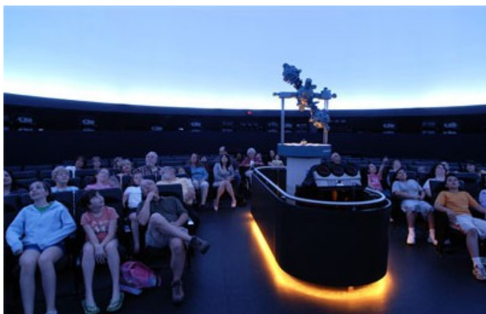
The Skymaster ZKP3/S projector in the Shafran Planetarium, Cleveland Museum of Natural History.