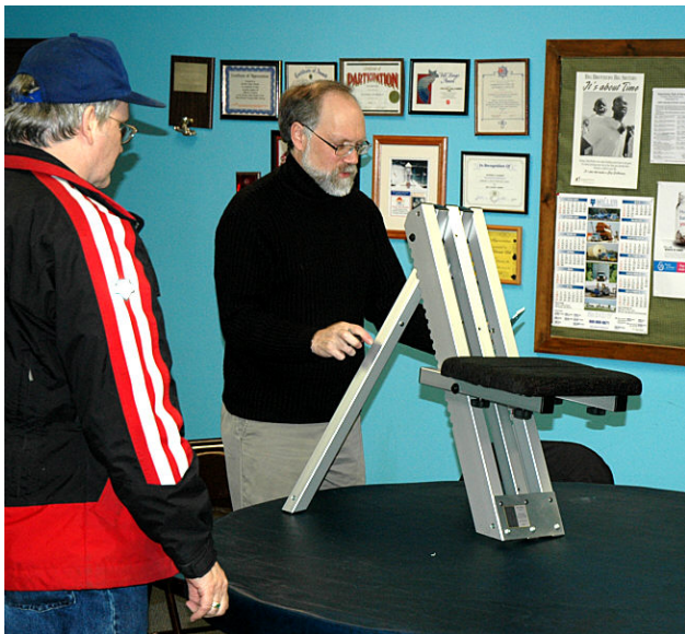
March Meeting

http://www.cmnh.org/site/atthemuseum_planetariumandobservatory.aspx