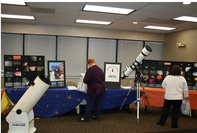
Members of the Sterling staff and the ACA's Learning Fair display