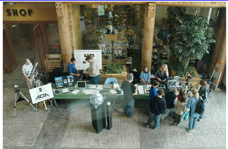
Astronomy Day- 2006