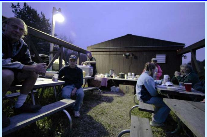
Views of the ACA's 2006 Messier Marathon. The club scope is seen in the left picture, demonstrating the position in which it remained for the entire event. The picture on the right shows the (g)astronomers, the food, and the cloudy skies.