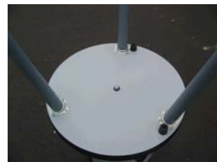
AZIMUTH PIVOT: INSIDE ROCKERBOX, UNDER GROUND BOARD

4) The rocker box, which is a framework for two half-round elevation bearing surfaces in which the bearing discs on the optical tube rest. The optical tube is free to rotate in elevation, with the bearings riding on slippery pads installed in the round cutouts in the rocker box.