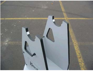
ELEVATION BEARINGS IN ROCKERBOX

Because the optical tube can swing freely in elevation (vertical motion) and the rocker box can spin freely in azimuth (horizontal motion), the telescope can easily be pointed to any area of the sky.