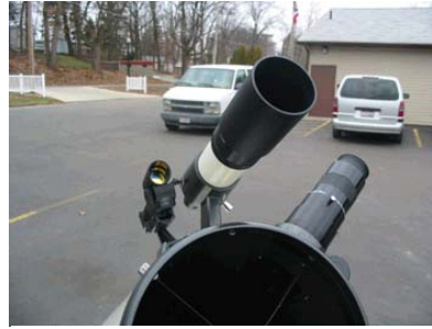
RED DOT FINDER, FINDERSCOPE, FOCUSER

The top of the tube is usually determined by the location of the focuser and finderscope. The focuser is sometimes directly in line with the bearing; if this is the case it could be used in either orientation - but if the finder winds up on the bottom it'll be very inconvenient later!