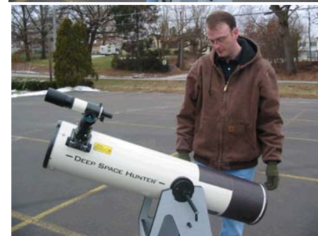
IT'S A TELESCOPE!