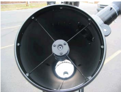
SECONDARY HOLDER - NOTE COLLIMATION SCREWS

Now it's a telescope, but we have some things to check before it's ready for use. First, we take a quick look at collimation.