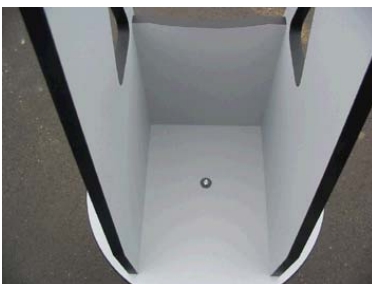
ROCKERBOX SHOWING FRONT WALL

Before placing the optical tube in position, one should observe the rocker box; these are usually not symmetrical. The tube will typically be permitted to tilt in only one direction by a vertical wall on the box. This wall is installed to provide mechanical rigidity. The optical tube will swing toward and above this wall, but the bottom end of the tube would strike the wall if tilted away from it. Thus, when the optical tube is installed the "top" side of it needs to be placed away from this wall. In the following photo, the optical tube would be able to swing only away from the camera - thus the finderscope should be on the nearer side of the tube