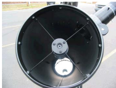
TOP OF TUBE - SECONDARY HOLDER & FOCUSER

Note that, although in this photo the telescope is pointed downward, it's not prudent to do so unless you have first verified that the type of primary cell used provides positive retention of the mirror. The primary cells used in some Newtonians would permit the mirror to fall if placed in this position.