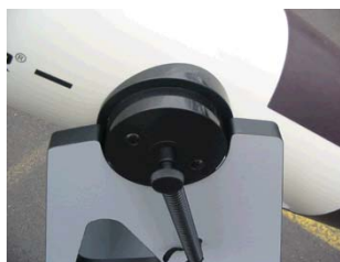
ELEVATION BEAR- ING DISK ON SIDE OF TUBE

(2) Disk-shaped elevation bearings fixed to this tube on opposite sides near the balance point as seen in the next photo.