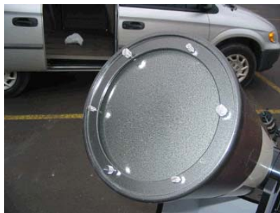
BOTTOM OF TUBE - PRIMARY ADJUSTING SCREWS

Note that, although in this photo the telescope is pointed downward, it's not prudent to do so unless you have first verified that the type of primary cell used provides positive retention of the mirror. The primary cells used in some Newtonians would permit the mirror to fall if placed in this position.