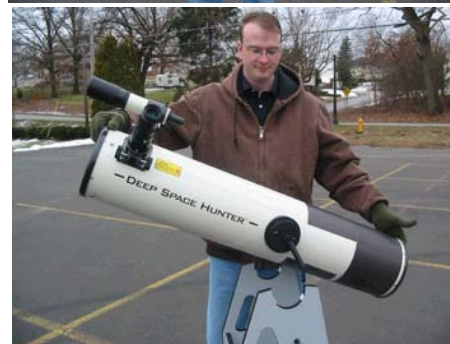
INSERTING BEARING DISKS INTO ELEVATION BEARINGS